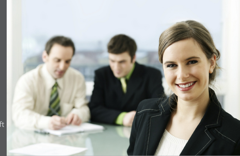
Example of B1UP use